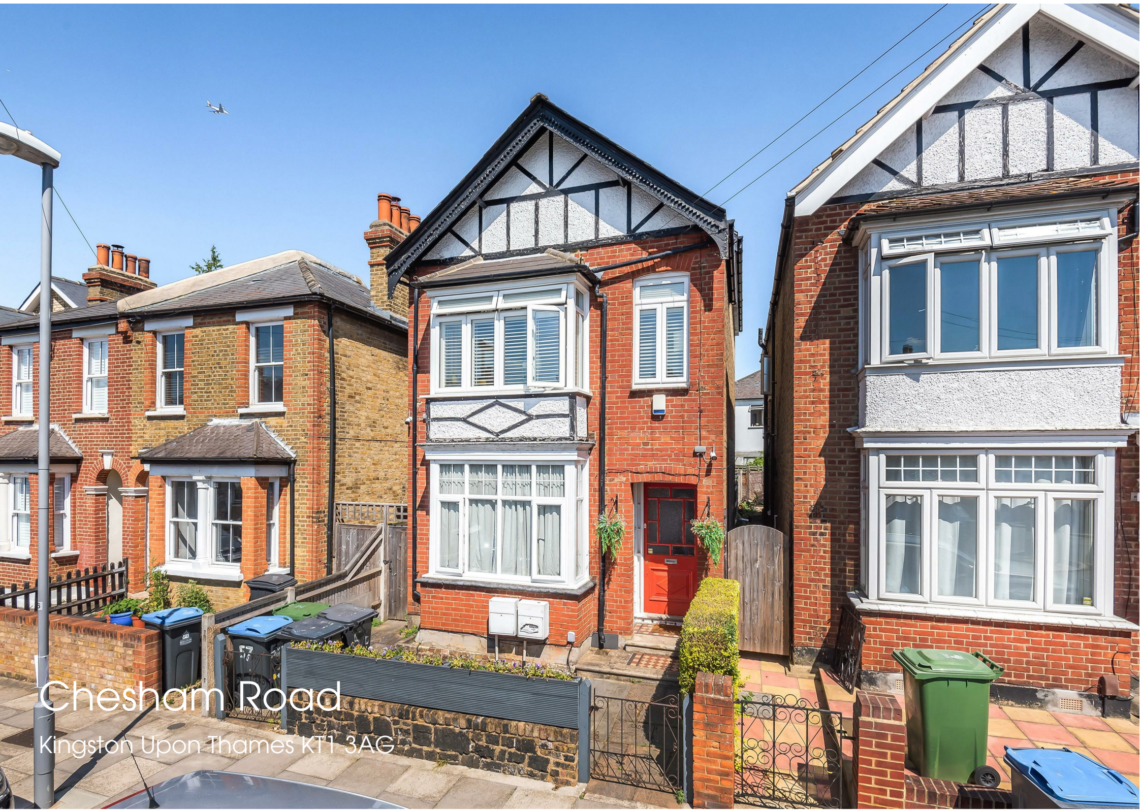
Chesham Road Kingston upon Thames KT1 3AG